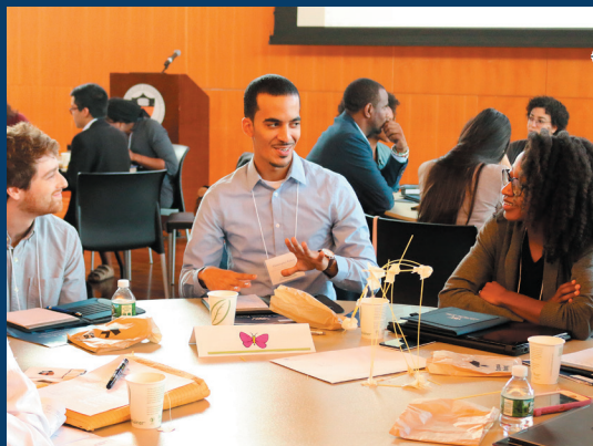
Virtual & local workshops