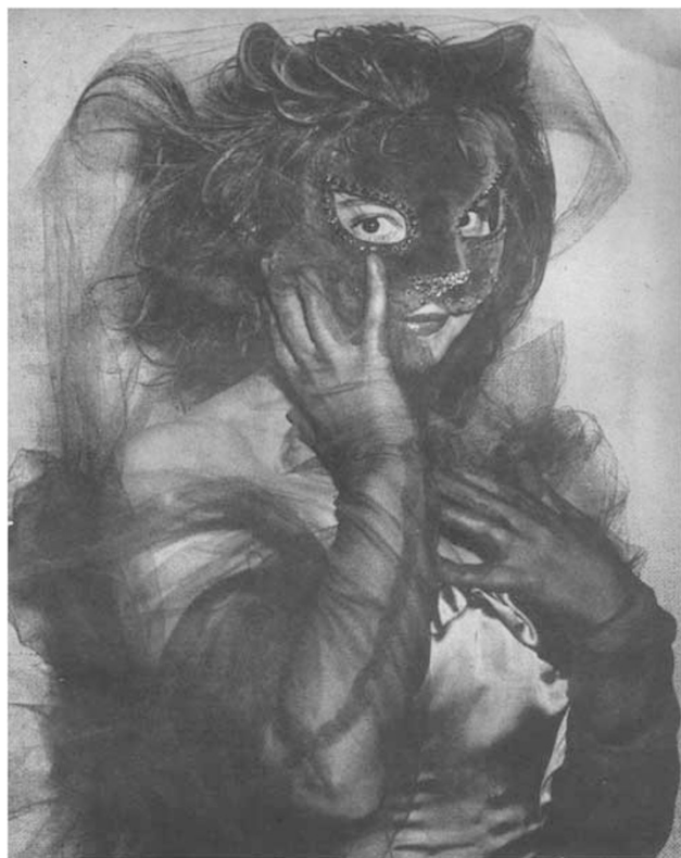
Figure 2 | Leonor Fini (1948).

Note: Image reproduced with permission of Richard Overstreet, on behalf of the estate of Leonor Fini; Copyright (@ Estate of Leonor Fini, 2016). This figure is not covered by the CC-BY 4.0 licence.