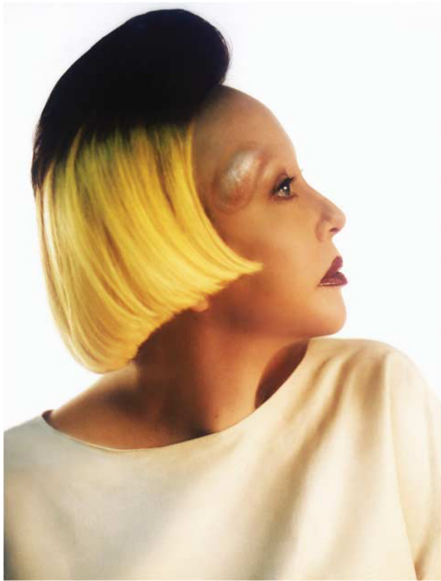
Figure 6 | ORLAN (1997).

Note: This image is covered by a CC BY-SA 4.0 licence and is attributed to Fabrice Lévêque ( https://commons.wikimedia.org/w/index.php?curid=36619853 ).