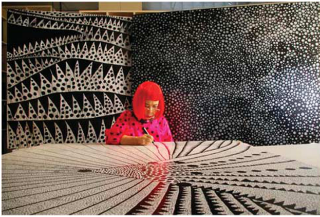
Figure 3 | Yayoi Kusama (2012).