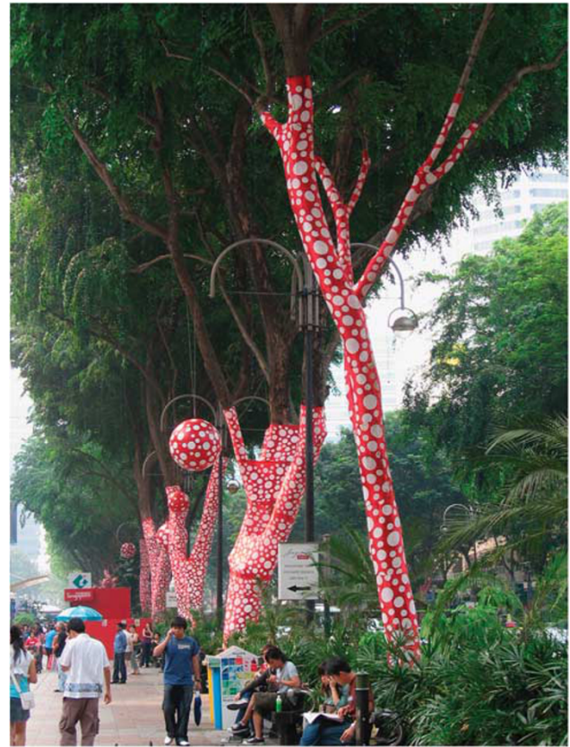
Figure 4 | Ascension of Polkadots on the Trees (2006), by Yayoi Kusama.

Note: This image was in the public domain at the time of publication. The copyright holder is User:Sengkang ( https://commons.wikimedia.org/w/index.php?curid=1297624 ). This figure is not covered by the CC-BY 4.0 licence.