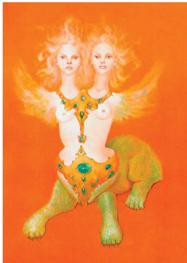
Figure 1 | Dithyrambe (1972), by Leonor Fini.

Surrealism also brought attention to the environment, which, as previously stated, characterizes critical Posthumanism. As Rosemont notes: “always implicit in surrealist thought, a radical ecological awareness is increasingly explicit in movement publications after 1945” (Rosemont, 1998: LI). Such awareness merged, for instance, in the paintings of US artists Katherine Linn Sage (1898–1963), whose large, surreal sights recall futuristic landscapes and science fiction movies. Both aesthetically and content-wise, posthuman evocations can be found in the works of Dorothea Tanning (1910–2012) and Leonora Carrington (1917–2011), whose interest for animal imagery, world mythologies and occult symbolism deepened after meeting the Spanish-Mexican surrealist painter Remedios Varo Uranga (1908–1963), who was influenced by a wide range of mystic and hermetic traditions, both Western and non-Western: from Carl Jung's archetypal