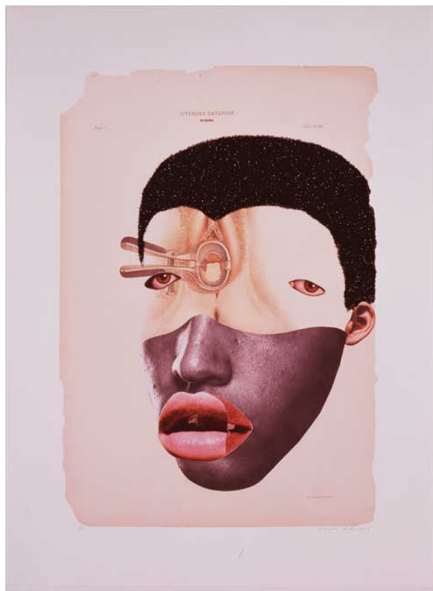
Figure 8 | Histology of the Different Classes of Uterine Tumors (detail), 2006.

Note: Image reproduced with permission of Natasha Vita-More; Copyright (@ Natasha Vita-More, 2016). This figure is not covered by the CC-BY 4.0 licence.