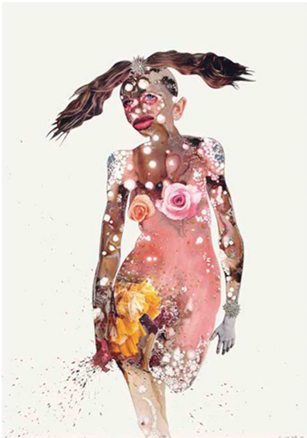
Figure 9 | All Rosey (2003).

This figure is not covered by the CC-BY 4.0 license.