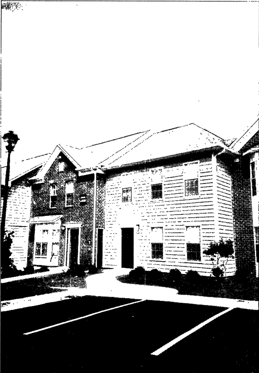
New townhouses at New Community at East Lake.